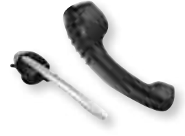
Wireless DECT Headset & Handset