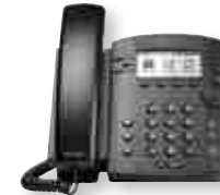
Polycom VVX 6-Line, 2-Line and 1-Line LCD Phones