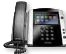
Polycom VVX 16-Line or 12-Line Color Touch Screen Phones