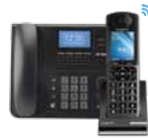
Cordless Desk Phone and Handset