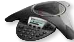
Polycom Conference Phone