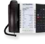
48-Key, 24-Key and 16-Key LCD Phones