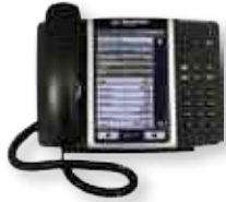
Color Touch Screen LCD Phone