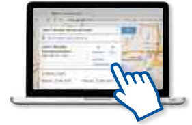
OfficeSuite® Connector for Chrome™