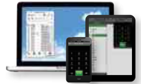
PC, Mac and Mobile Softphones